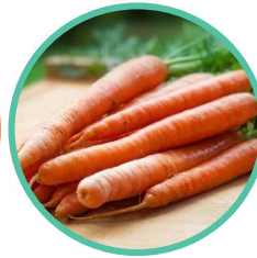
Hard raw veg

Click here for more information on how to ensure the food provided is safe for their age & reduce the risk of choking.