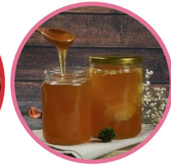
Honey (<12 months)