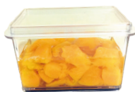
Portion out bulk buy diced fruit in juice $0.51 per 120g portioned out ✔ Still a healthy choice