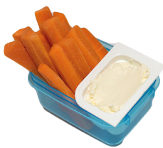
Go fresh with veg and dip instead of chips $0.30