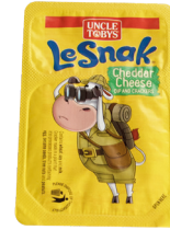
Crackers & cheese dip = $0.75 each