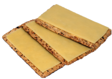
Dice your own block cheese and rice crackers $0.45 ✔ Healthy choice

The snacks in this lunchbox cost $1.26 Cost over a childcare year (48 weeks at 3 days a week) = $181 SAVE over $250 a year or even more if your child eats these snacks every day!