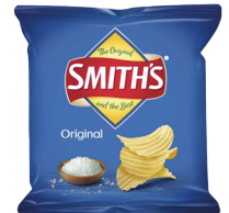
Chips = $0.52 each